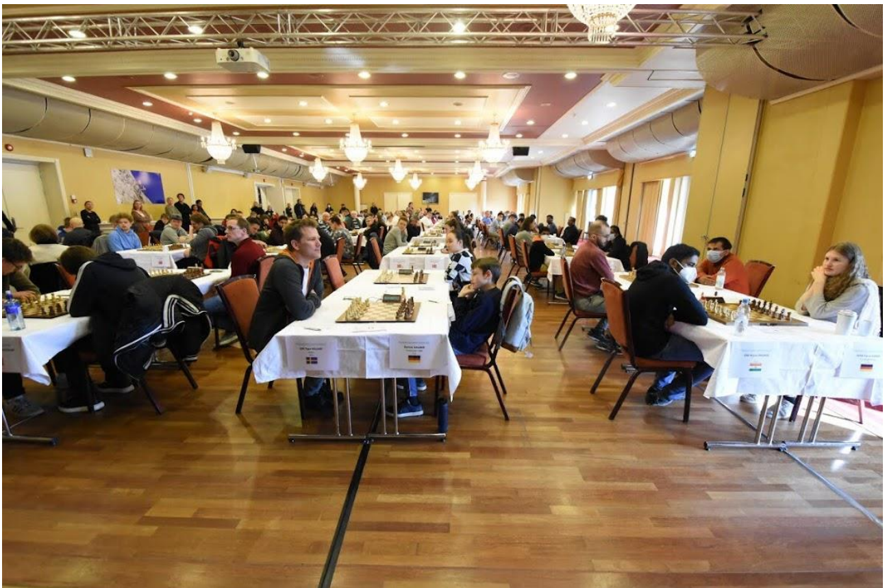
The Playing Hall at Fagernes, and the starting round of the edition in 2022.