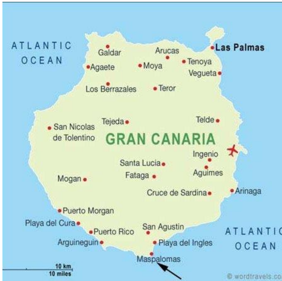
map las palmas maspalomas – Google Suche