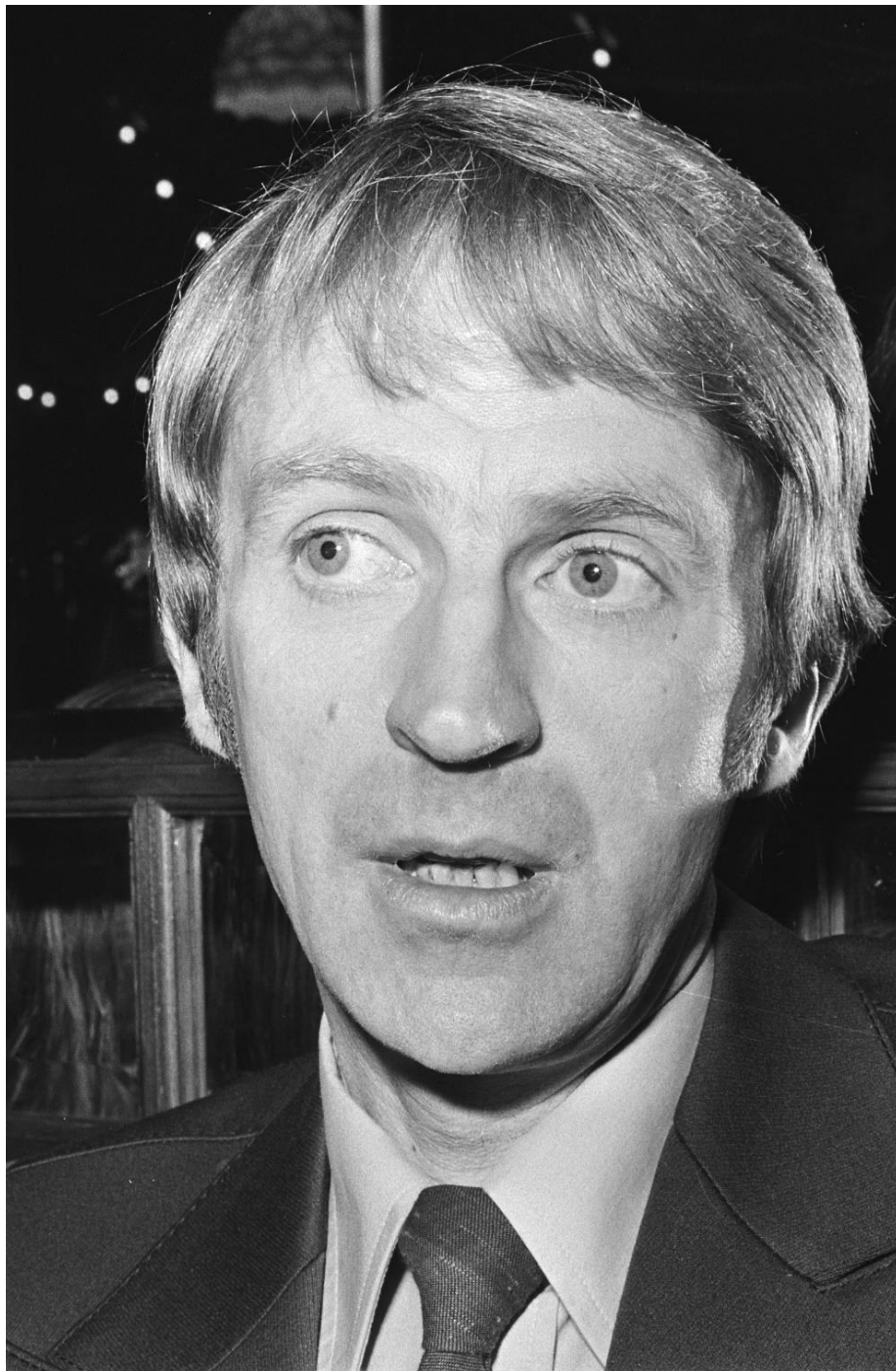
Olafsson F., Portrait, 13 May 1976