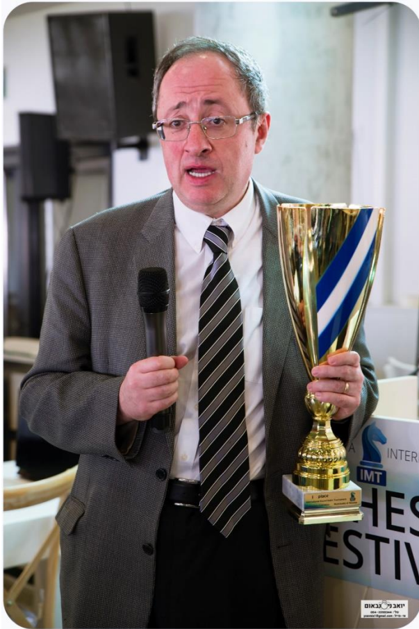
Boris Gelfand, the winner of 2019

The Netanya Masters was a round robin invitational tournament with 10 players of which five are world class players and the other five are from the Israeli top ones.