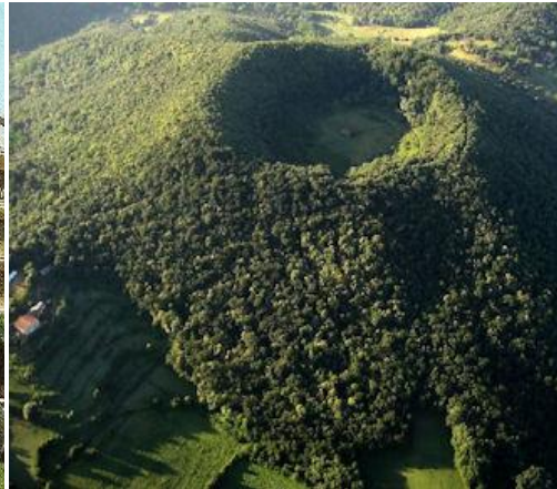
Volcano near Olot