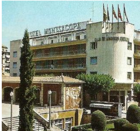
Hotel Montsacopa, the tournament hall