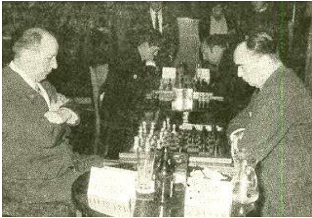
Ulvestad - O'Kelly de Galway 0-1, Olot 1969