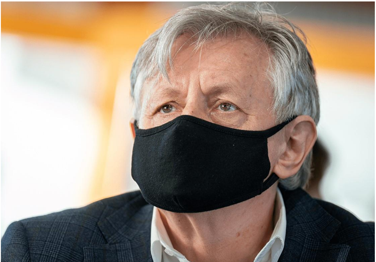
With face protection mask at the Sunway Sitges Open Festival in December 2020.