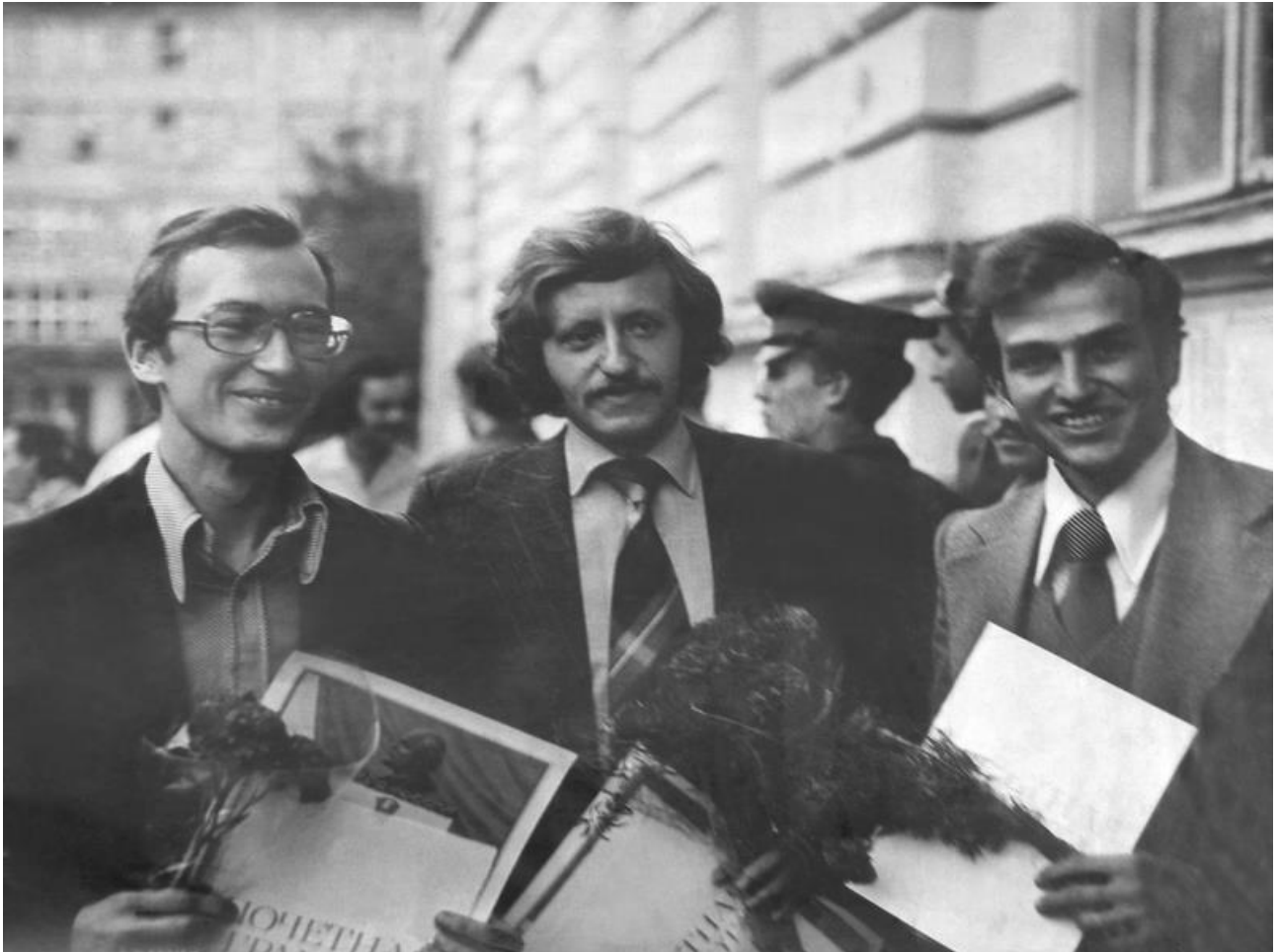
Lviv – the chess capital of Ukraine: young Mikhalchishin, Romanishin, and Beliavsky in good mood.

Remember, in the year 1973, Oleg Romanishin won the Youth European Chess Championship, meanwhile Alexander Beliavsky won the Junior World Chess Championship in Teesside, England.