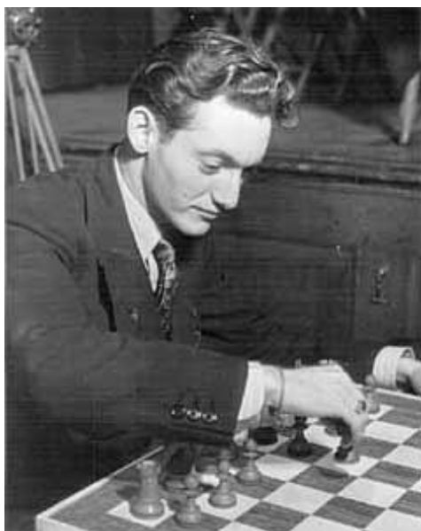
Yanofsky in 1947

He represented Canada at eleven Olympiads : ( Buenos Aires 1939 {13.5/16}, Amsterdam 1954 {9/17}, Munich 1958 {5.5/11}, Tel Aviv 1964 {10/16}, Havana 1966 {3.5/5}, Lugano 1968 {6/14}, Siegen 1970 {7/14}, Skopje 1972 {6/13}, Nice 1974 {7/14}, Haifa 1976 {3.5/10}, and Malta 1980 ) {6/11}, a total surpassed among Canadians only by IM Lawrence Day (thirteen).