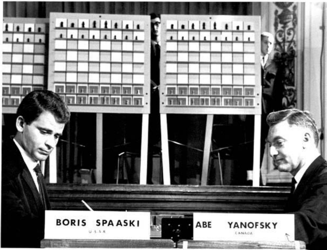
Winnipeg Canadian Centennial Tournament in 1967: Spassky vs. Yanofsky (round 1)