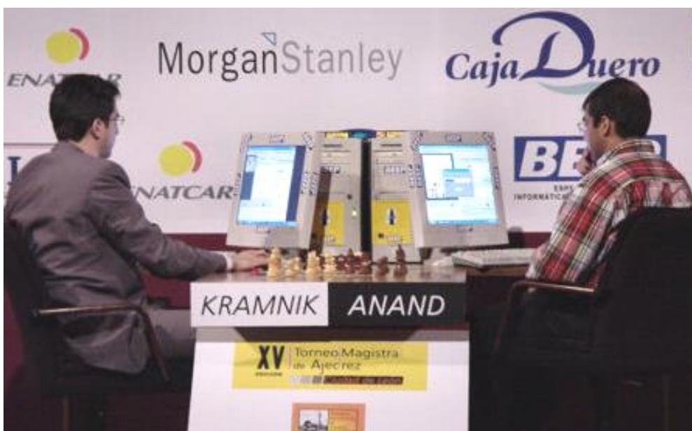
Kramnik and Anand playing with the help of a computer 😊

The 33rd Masters "Ciudad de Leon" in 2020, and also the 34th edition in 2021, due to Coronavirus, have been held online , on www.Chess.com (again in a rapid knock-out of four players format ).