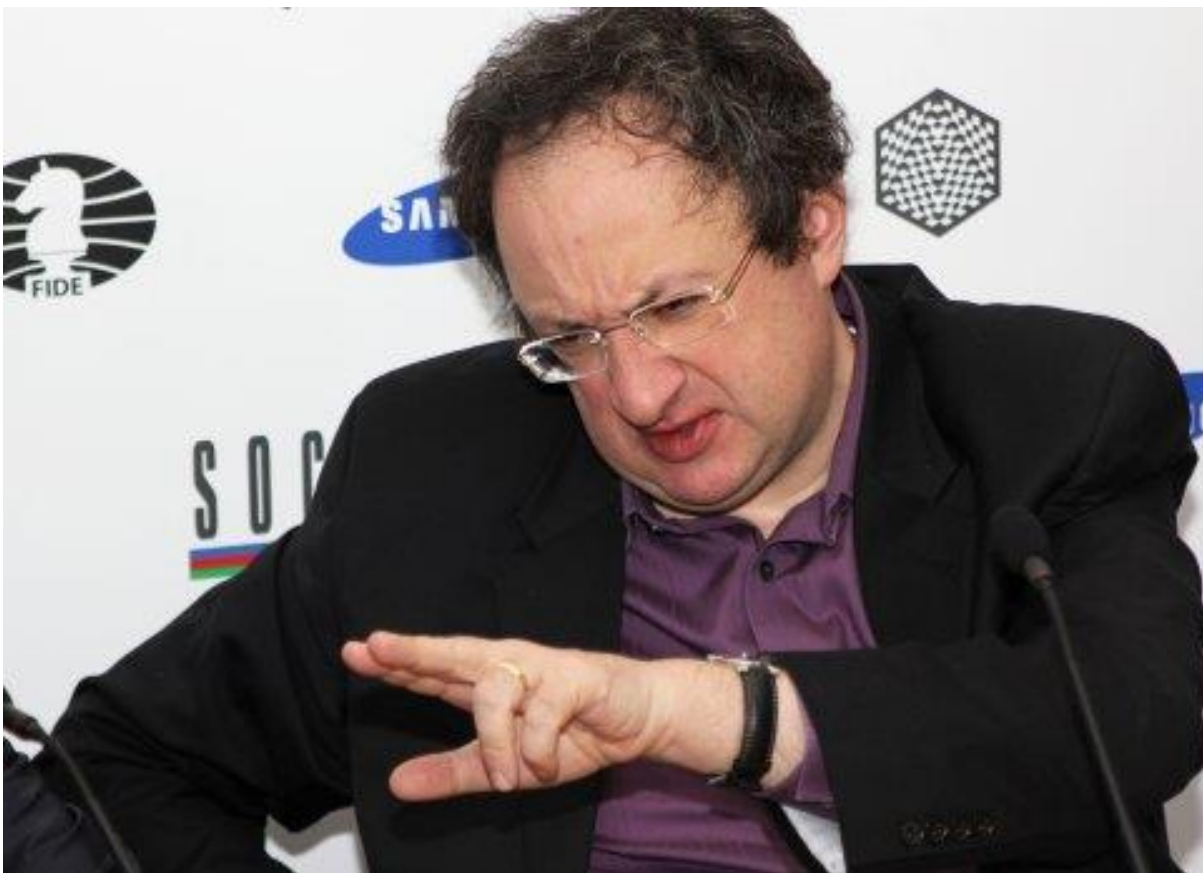
Boris Gelfand, born 1968, winner in 2021 , pictured at the Candidates in London 2013 (series is ongoing)