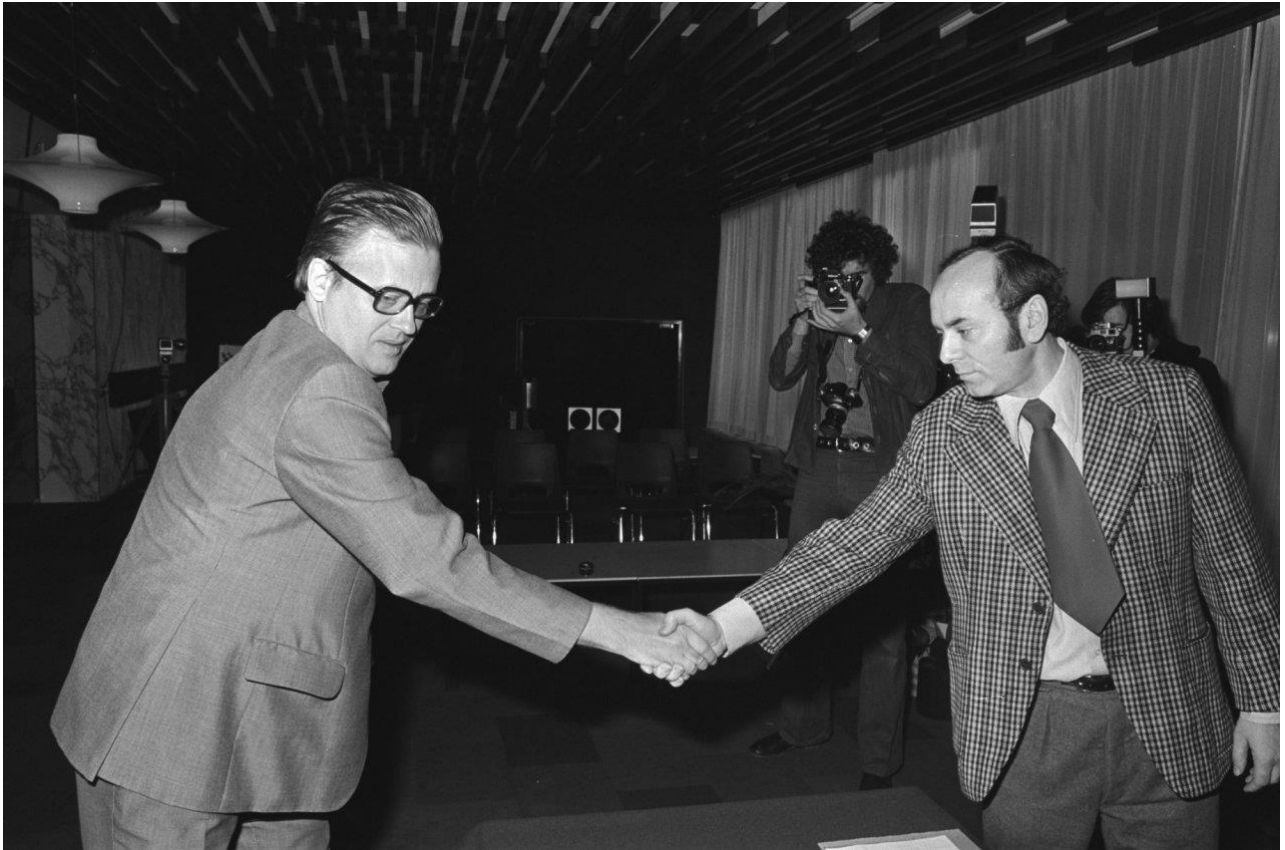
Handshake between Bent Larsen (born 1935) and Lajos Portisch (born 1937) in Rotterdam in 1977, at Candidates Quarter-Final, Portisch won that match and advanced. Note: Larsen had won their Candidates Quarter-Final in 1968. In lifetime overall scores, Portisch has a clear plus.

Portisch has beaten six World Champions in classical chess: Smyslov, Tal, Petrosian, Spassky, Karpov, & Anand, virtually all stars of his time, Korchnoi, Keres, Geller, Polugaevsky, Beliavsky, Larsen, Miles, Short, Hübner, Timman, Najdorf, Reshevsky, Ljubojevic, Gligoric, Hort, Szabo, etc.