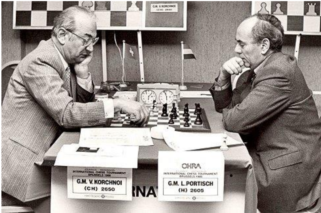
Korchnoi vs. Portisch, Brussels OHRA '86