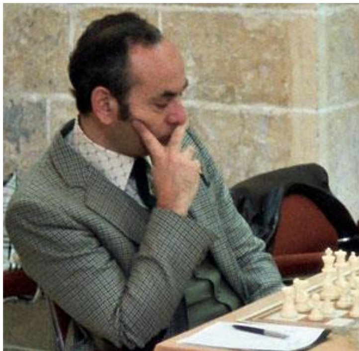
Lajos Portisch at the Chess Olympiad in Malta in 1980