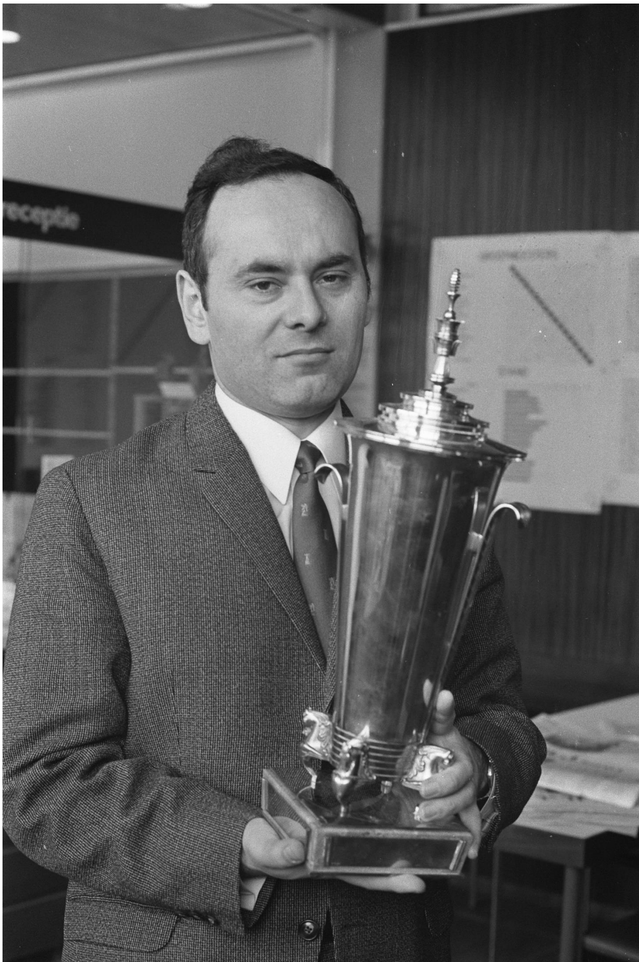
Four times winner in Beverwijk / Wijk aan Zee (Hoogovens)