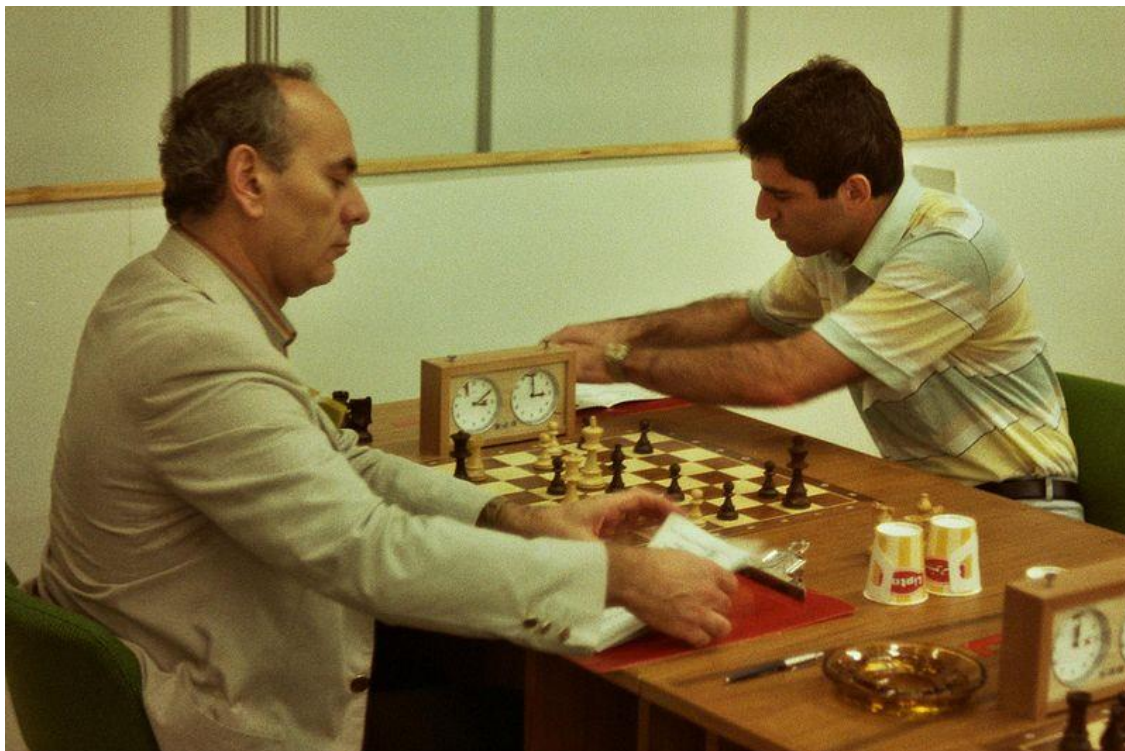
Portisch vs. Kasparov, Dubai Chess Olympiad '86

They first met otb in <1961> (Maroczy Memorial, ten years after Geza Maroczy had died), and last in <2011> (Botvinnik Memorial Veterans, Rapid, Hundred years Anniv of Mikhail Botvinnik). Vic won both tournaments outright and comfortably, but Portisch won their Mini-Match on board three during the famous USSR vs. Rest of the World battle in Belgrade in 1970. Later, Korchnoi won their Candidate's quarter-final played in Bad Kissingen in 1983.