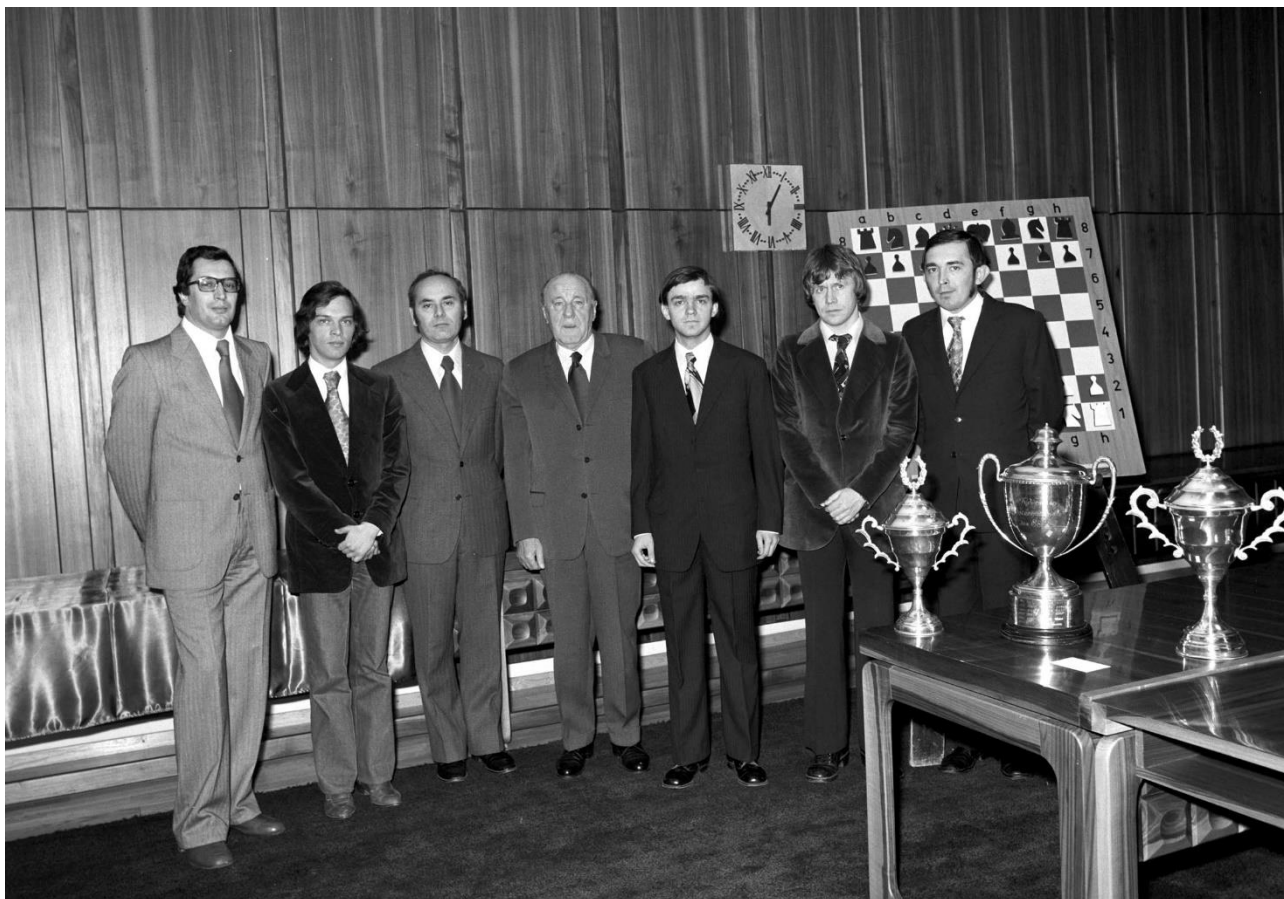
Hungarian Olympic gold medal team with Janos Kadar in Budapest, 4 December 1978. remonews.com