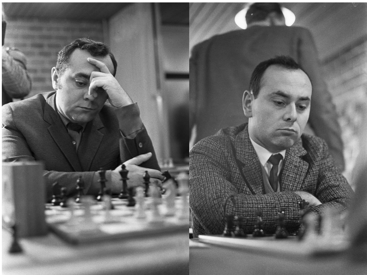
IM Ferenc Portisch (*1939), the younger brother of GM Lajos Portisch (*1937)

Lajos Portisch lives in Hungary. His younger brother is Ferenc Portisch .