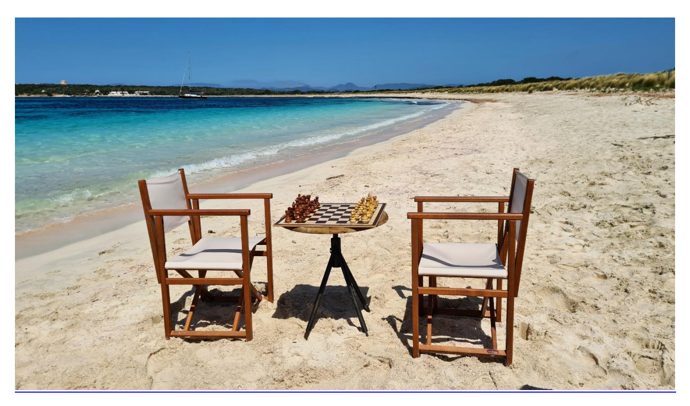
Chessable Sunway Formentera Festival 2022.