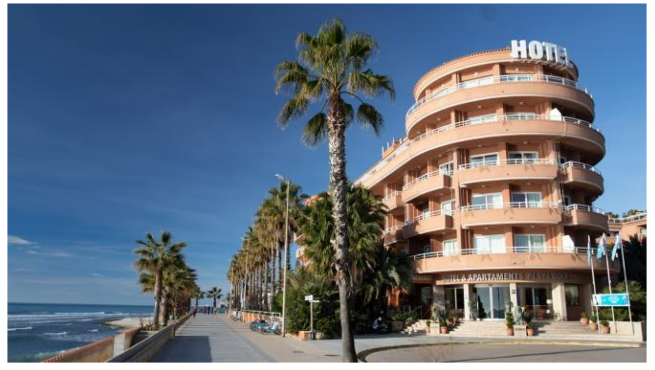
Sunway Playa Golf & Spa Sitges hotel is located right along the Balearic Sea beach . Peter Doggers, Chess.com: <u>Veterans, Prodigies Clash At Sunway Sitges Chess Festival - Chess.com</u>

Sitges (Catalan pronunciation: ['sidʒəs]) is a town about 35 km southwest of <u>Barcelona</u>, in <u>Spain</u>, renowned worldwide for its <u>Film Festival</u> and <u>Carnival</u>. Located between the <u>Garraf Massif</u> and the Balearic sea, it is known for its beaches, nightspots, historical sites, and Chess Festivals . (Wikipedia)